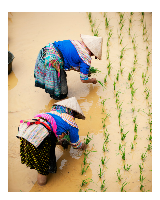
Above: Indigenous Hmong women plant rice shoots in Bac Ha, Viet Nam.

43 International Indigenous Peoples' Forum on Climate Change. 2015. "Recommendations to the zero drafts of Paris Agreement and COP decisions". Bonn, Germany.