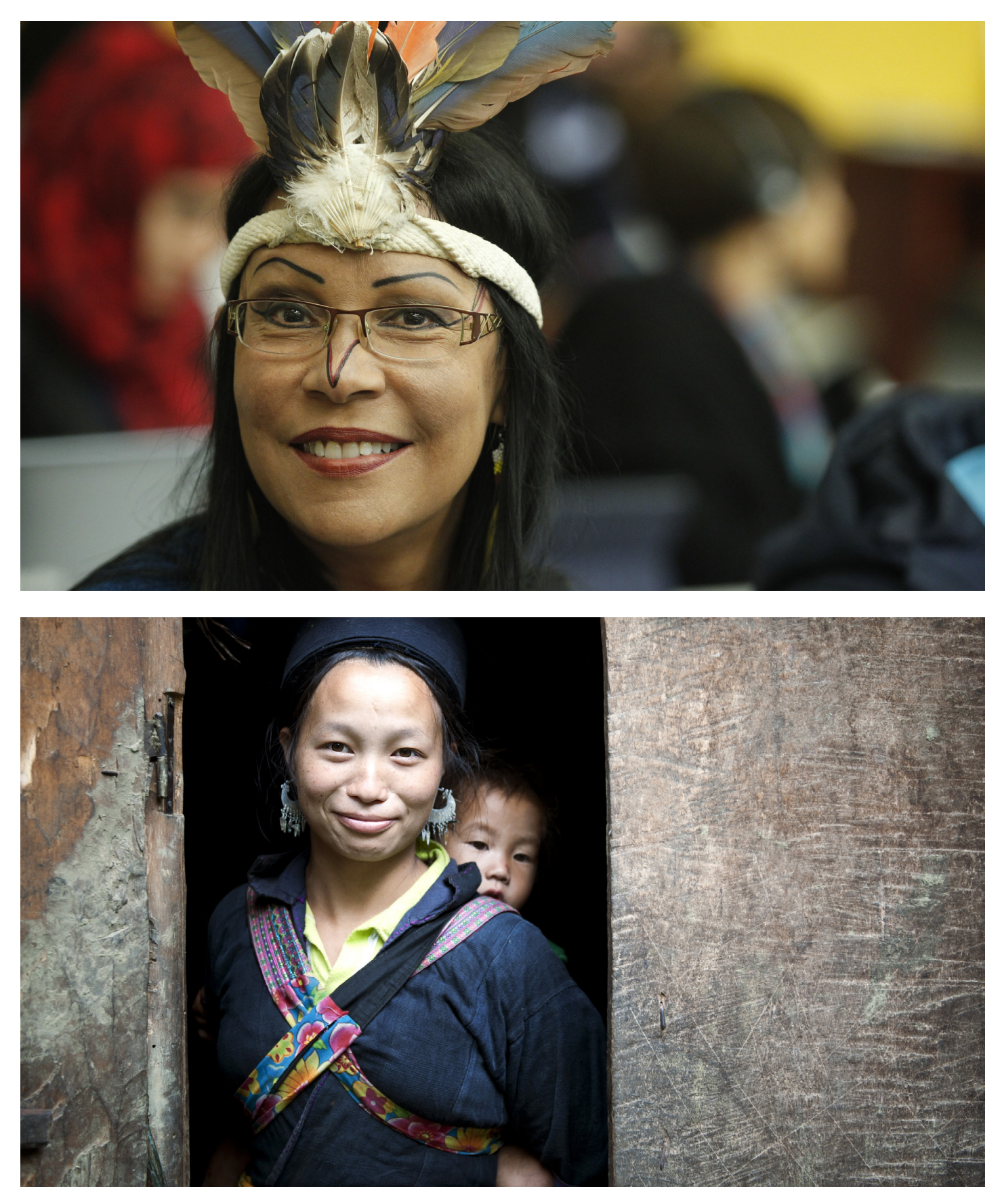
From top : A participant at the First World Conference on Indigenous Peoples © UN Photo / Loey Felipe. A Hmong woman and her baby in the village of Sin Chai, Viet Nam. © UN Photo / Kibae Park.