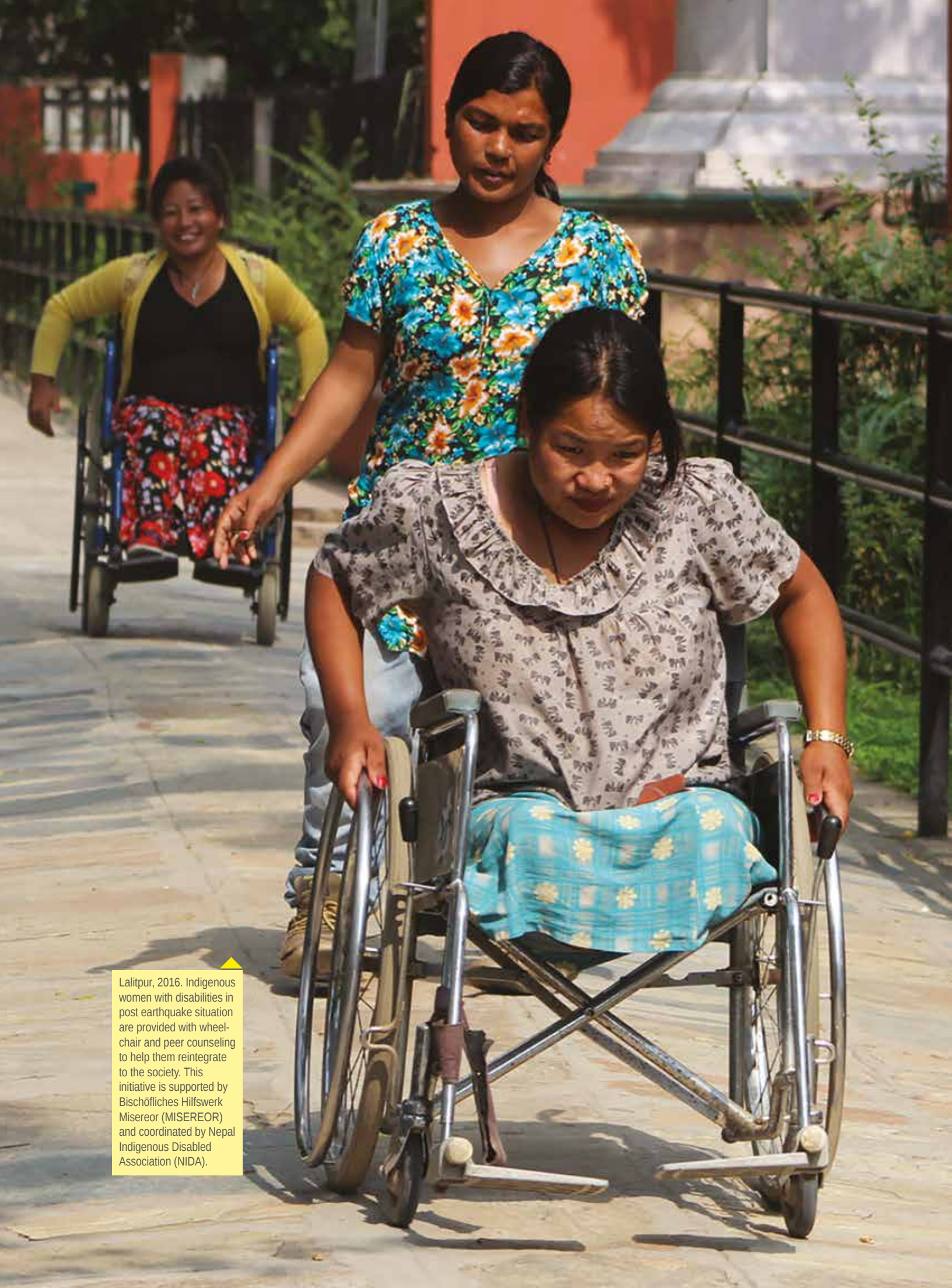
Lalitpur, 2016. Indigenous women with disabilities in post earthquake situation are provided with wheelchair and peer counseling to help them reintegrate to the society. This initiative is supported by Bischöfliches Hilfswerk Misereor (MISEREOR) and coordinated by Nepal Indigenous Disabled Association (NIDA).