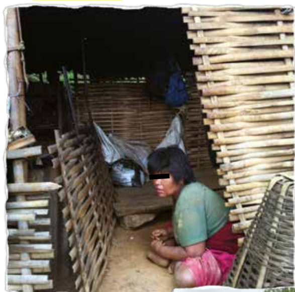
Before the support

For women with disabilities, maintaining hygiene is very challenging, especially during their monthly periods. Those who do not have caretakers have high possibilities of living in unsafe, unprotected, and neglected situations while the risk of being abused and raped are heightened. Earthquake survivors including IWWDs, their families and caretakers have further realized the insecurity, trauma, fear and anxiety triggered by disasters.