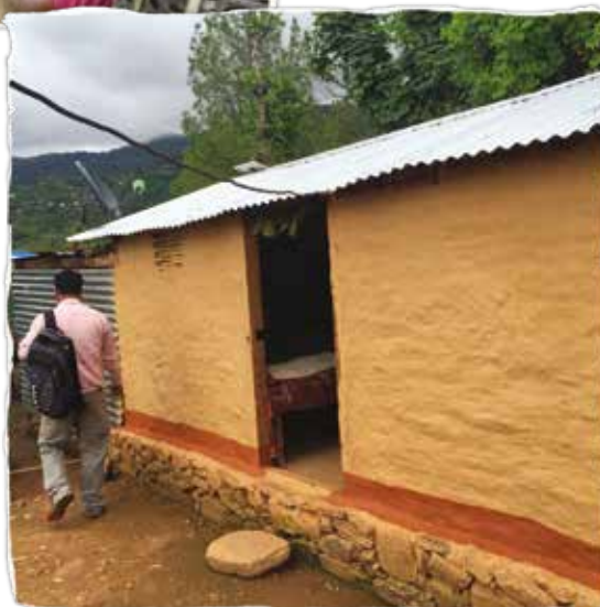
After the support

A program supported by SAWF and coordinated by NIDWAN provided a shelter to an indigenous woman with intellectual disability in Ramechap district. Indigenous women with intellectual disability experience intersectional discrimination based on gender, caste, ethnicity, geography and economic condition.