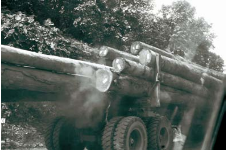
Felled logs being transported out on a truck.