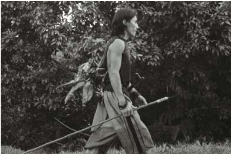
A Penan villager returning to the village from a hunting trip.