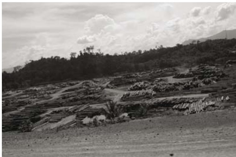
Piles of felled logs on the way out of Baram.