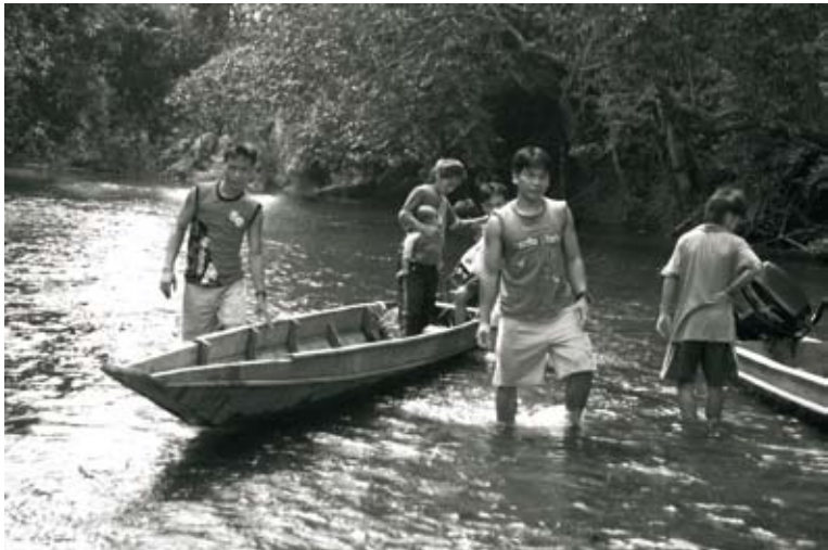
Villagers preparing for a trip outside the village by boat. Boats such as these are one of the main modes of transportation for the Penan villagers in Middle and Upper Baram.