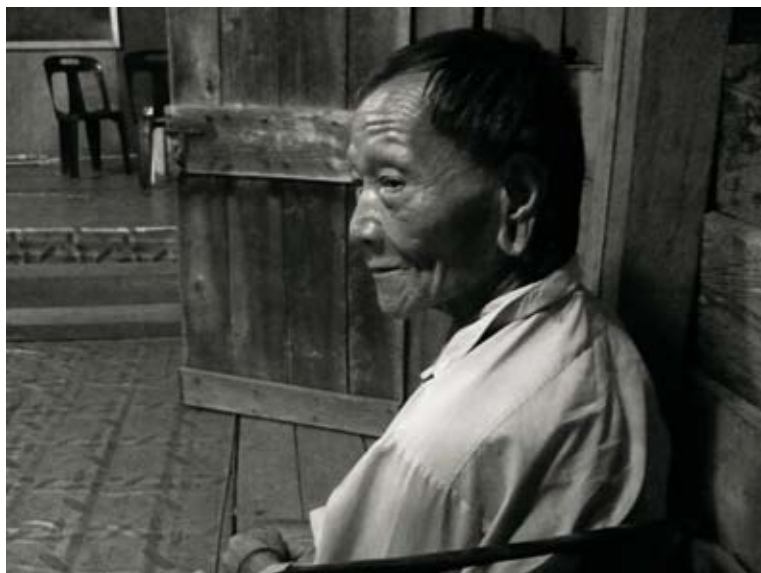
An elderly Penan man inside the village church.