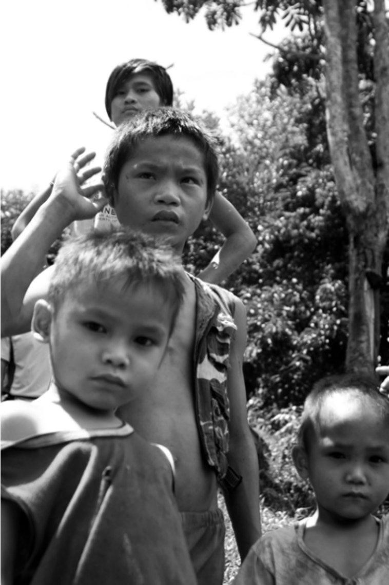
Penan children by the river.