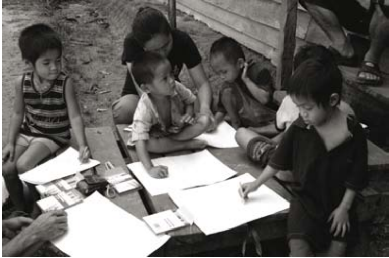
Penan children learning to draw and sketch using materials provided by the mission members.