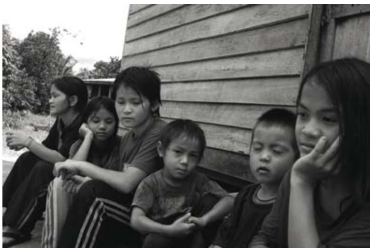
Penan children outside the village church.