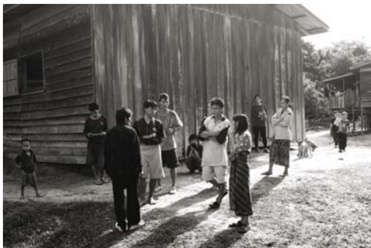
Villagers outside the village church. The village church is the centre of the villagers' social activities.