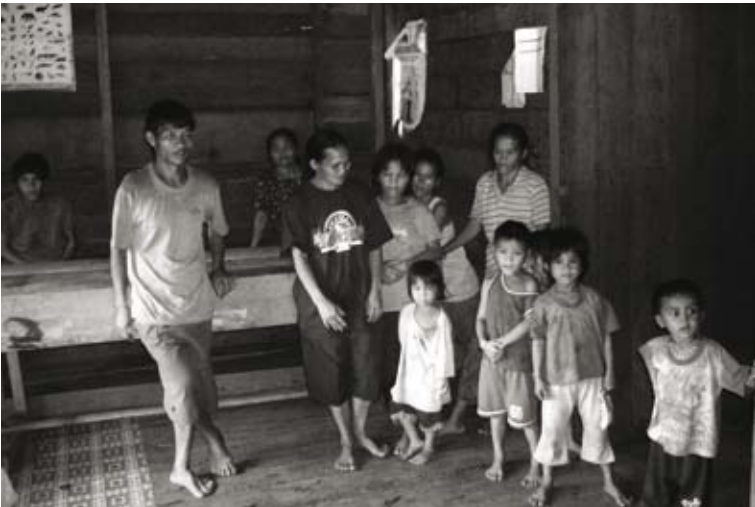
Some villagers looking on while others were being interviewed by the mission team.