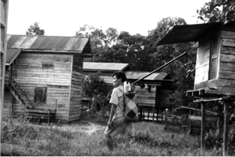
A Penan villager on the way out of the village for a hunting trip.