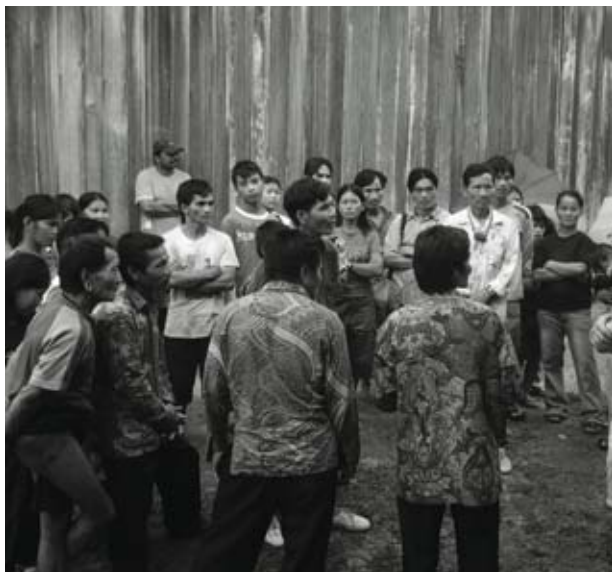
General briefing for the villagers on the fact-finding mission.