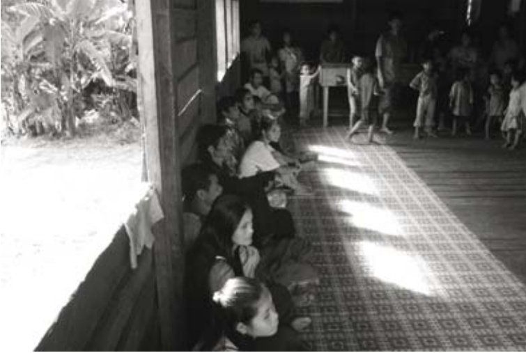
Villagers being briefed on the interviews scheduled by the mission members.