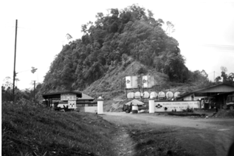
Entrance to one of the camps of logging company Samling in the Baram area.