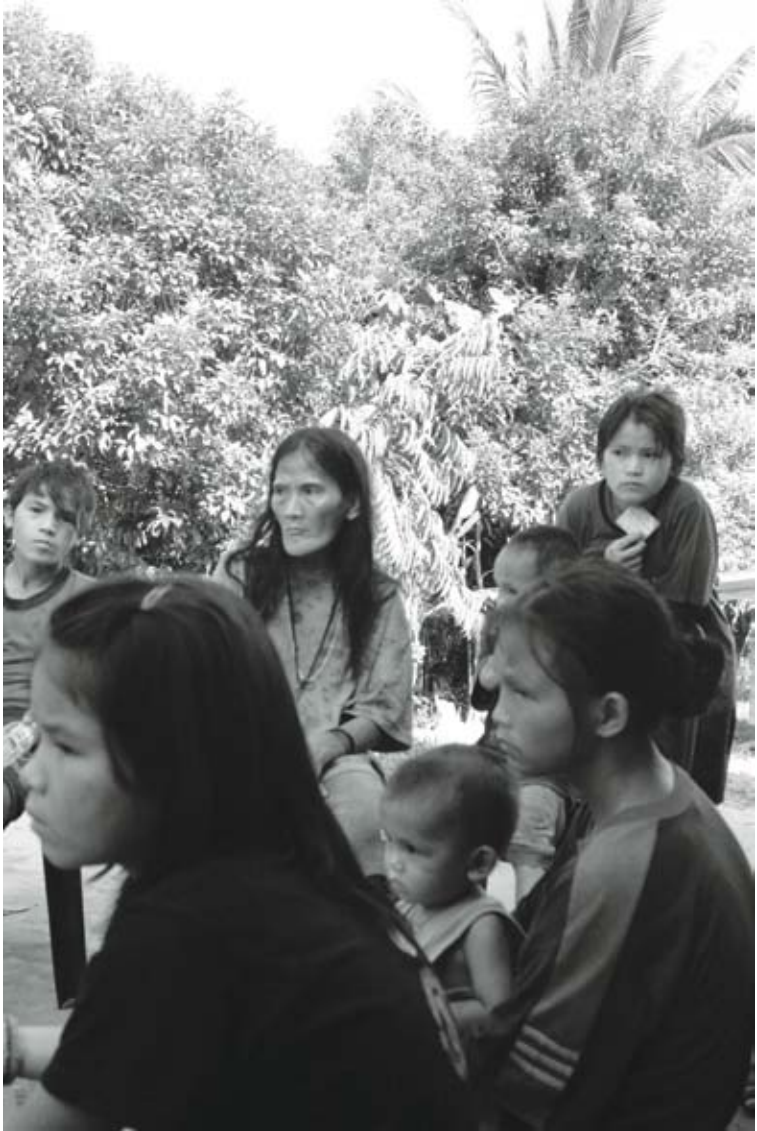
Several Penan women and children listening to members of the fact finding mission.